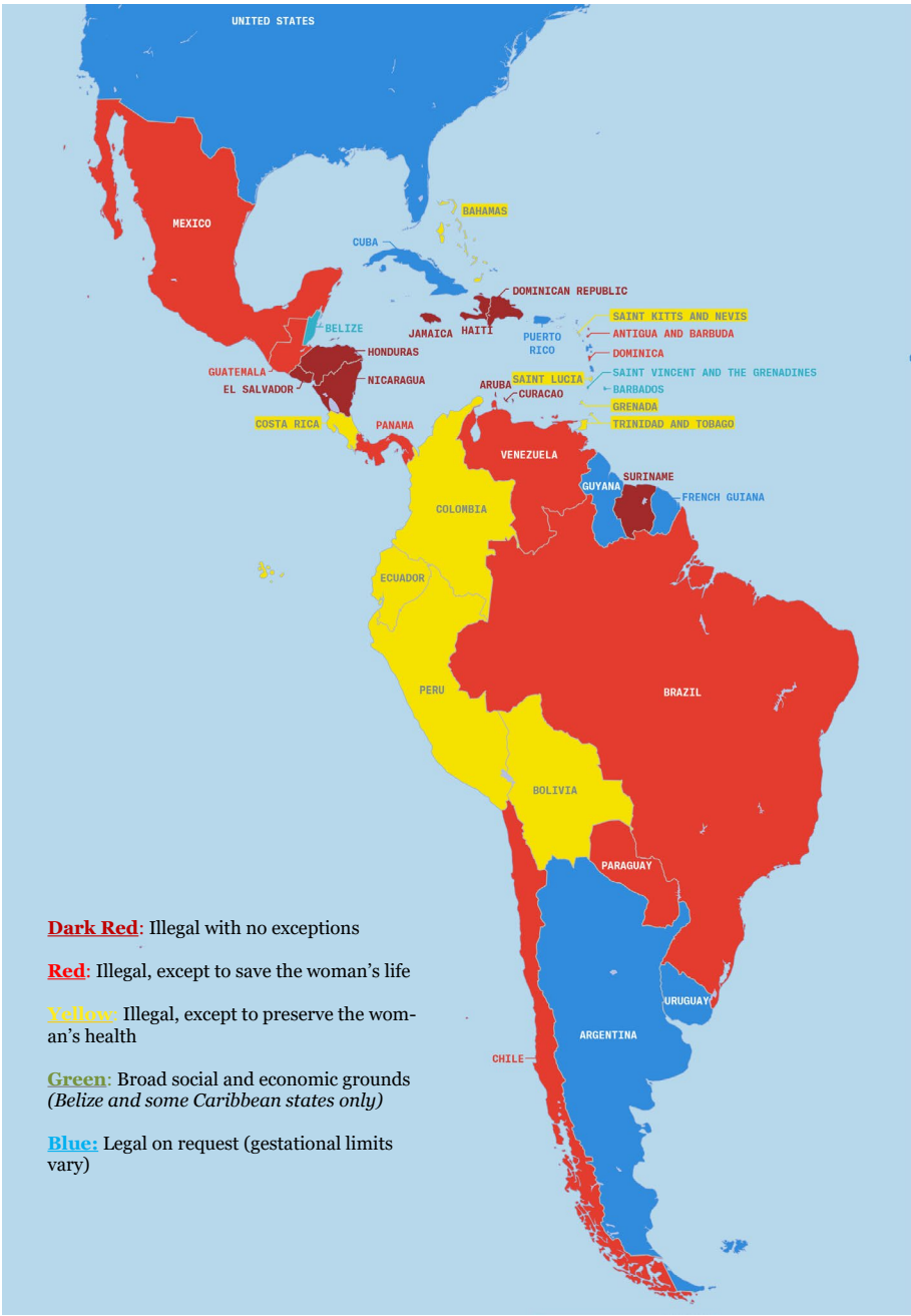
Figure 1 Abortion Laws in Latin America

This map also shows where Latin American and Caribbean countries' legislation stands with regard to abortion: